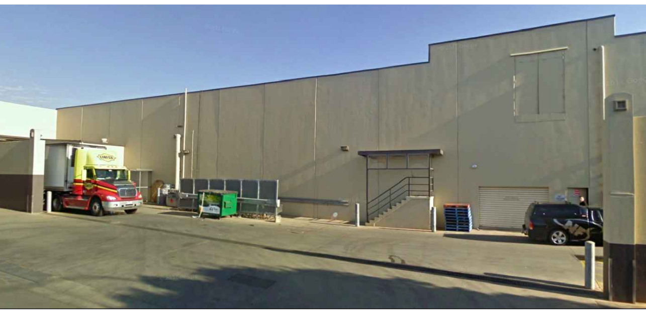
site photo - view 3 forsyth street loading dock