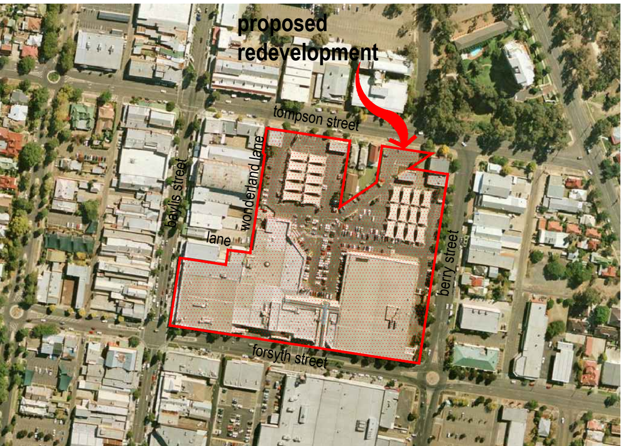
locality plan nts

notes: this drawing has been prepared utilising survey information provided by esler & associates - job reference.: 70558 dated 12 06 13 with ahd datum.