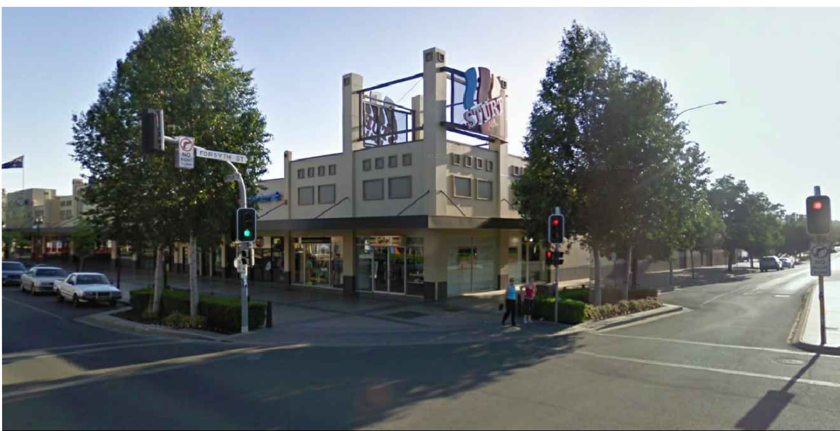
site photo - view 2 cnr bayliss & forsyth street