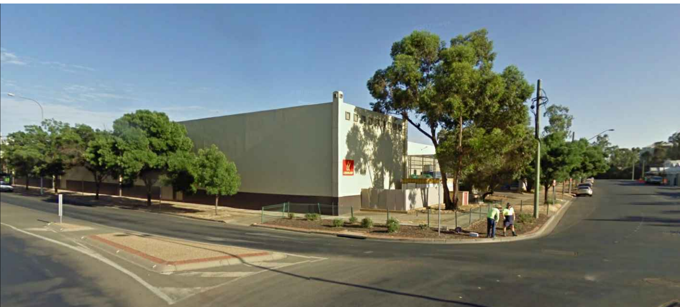
site photo - view 5 cnr forsyth & berry street