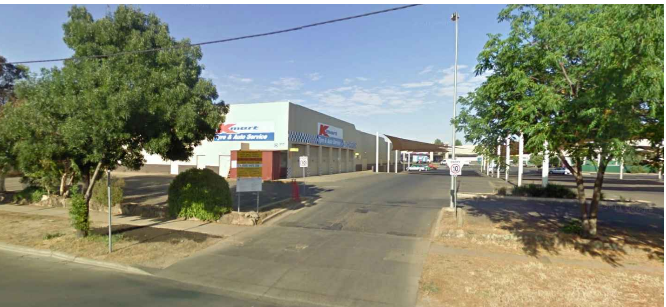
site photo - view 6 berry street & carpark entry