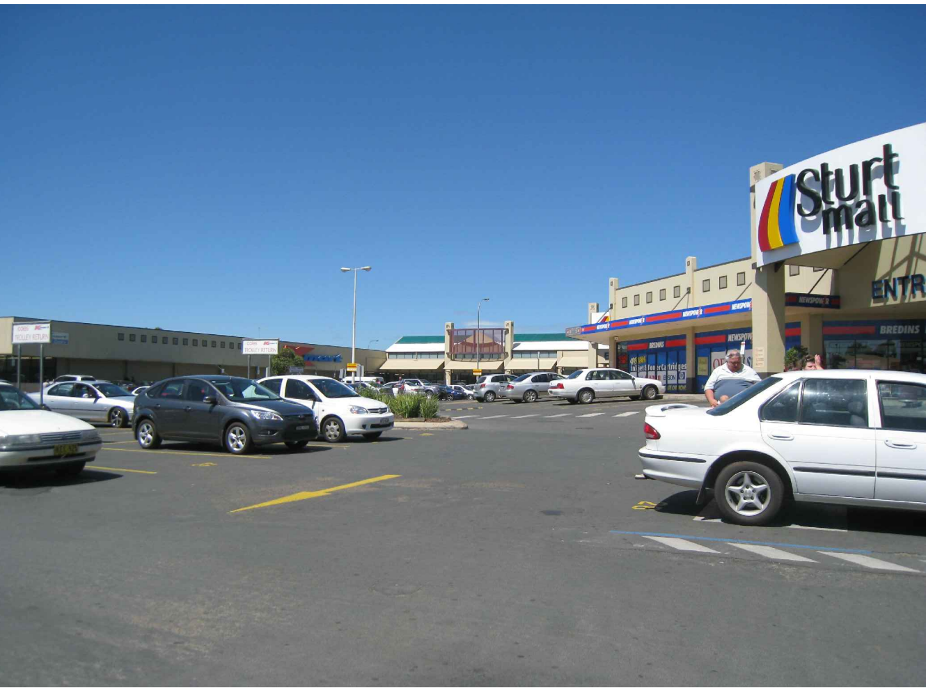
site photo - view 7 carpark & entry statement