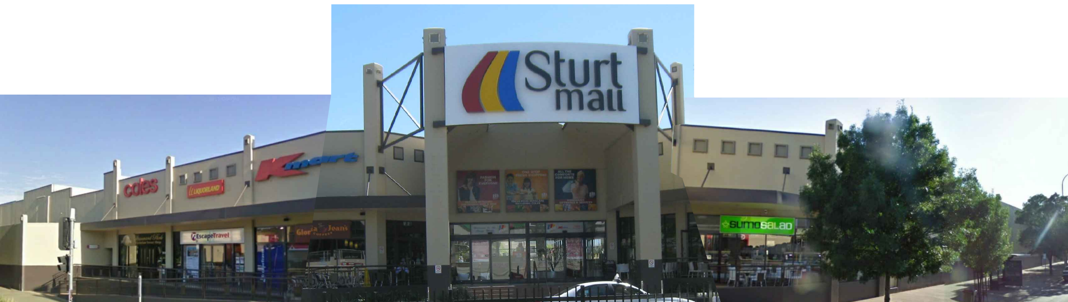
site photo - view 4 forsyth street