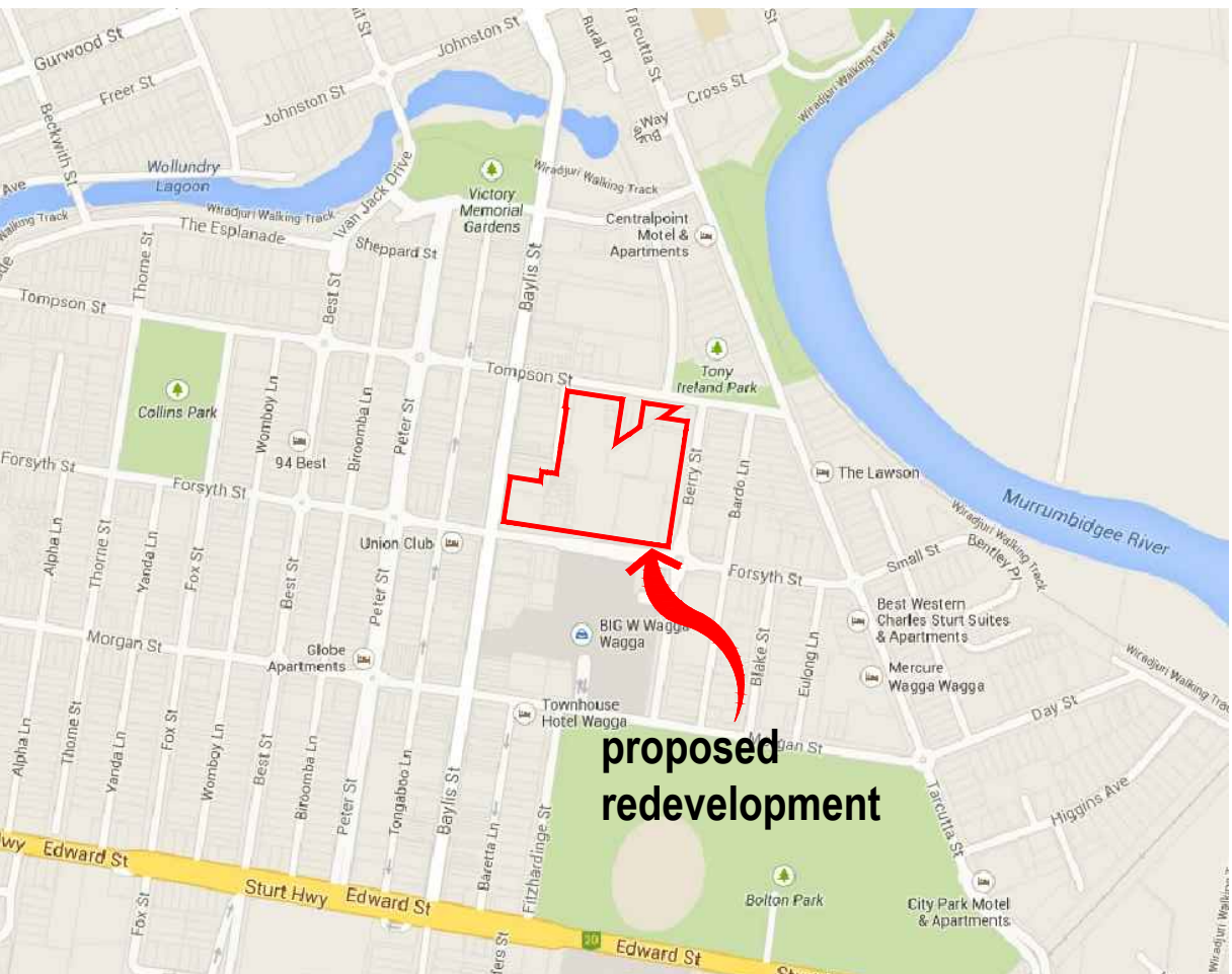
location plan nts