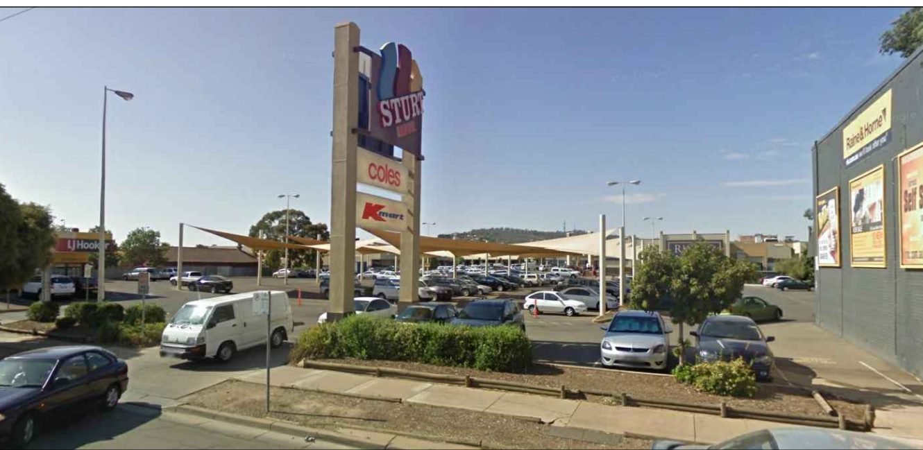
site photo - view 8 tompson street